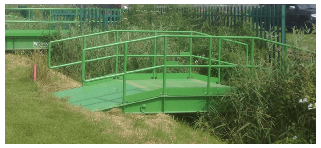
Figure 1.3 Indicative Temporary Ditch Crossing Bridge