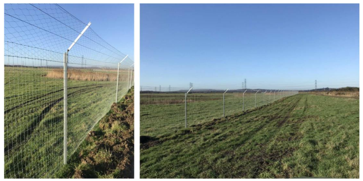
Figure 1.2 Example Predator Exclusion Fence